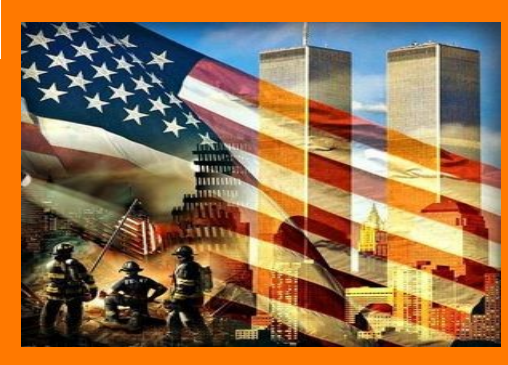
Never Forget! Remember. Reflect. Honor.